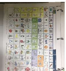
Attached to a one-page communication board.